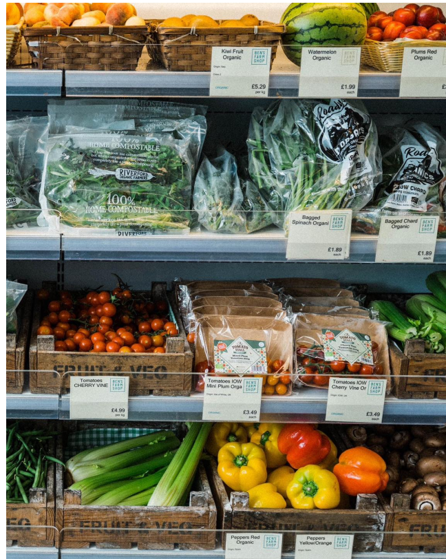
Ben's Farm Shop is our go-to

Virtually all the food & drink we supply to you in your accommodation is organic. Using local produce reduces 'Food Miles', so sourcing local food is very important to us & additionally, it supports local jobs. We supply locally sourced and homemade food to order as we understand that buying the right amount for your stay can be tricky & we can take some of that hard work out for you. It is really disheartening to see the amount of food waste left by some guests; nearly always stacks of supermarket food overbought and then uneaten.